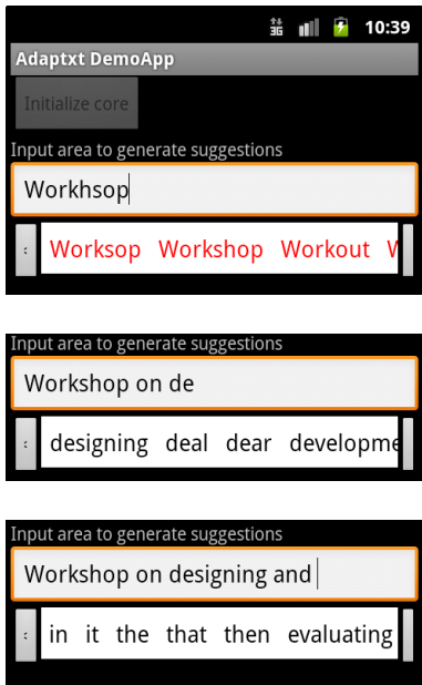
Figure 1: Sample interaction with OpenAdapttxt Android Demo – upper panel per image shows text typed with the lower widget showing OpenAdapttxt suggestions